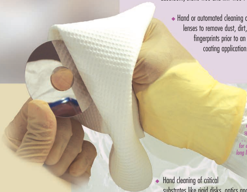
Textured and reinforced PVA sponge wipes . . . reinforced for extra long life