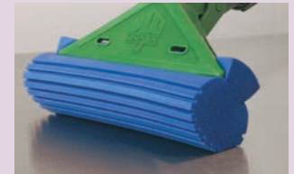
Ribbed Block Mop with industrial grade handle extending up to 8 feet