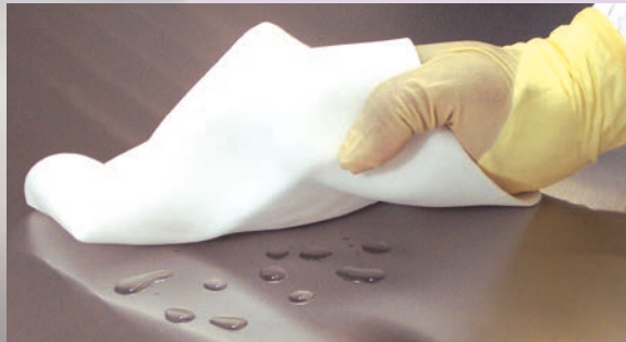
PVA sponge wipes . . . critical surface wiping