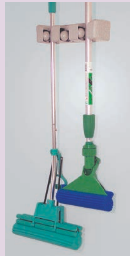
Wall hanging mop organizer holds mops with gravity gripper