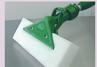
Smooth Block Mop with industrial grade handle extending up to 8 feet