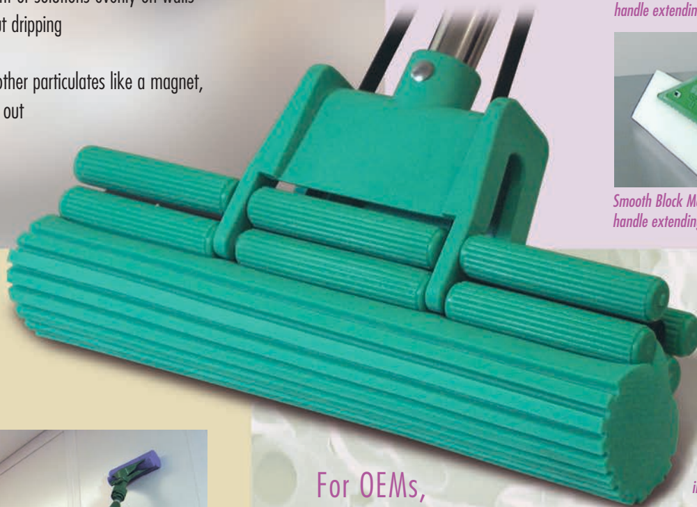
PVA Ribbed Block Mop with 4.5 foot extension handle and double roller wringer . . . wrings out excess liquid instantly