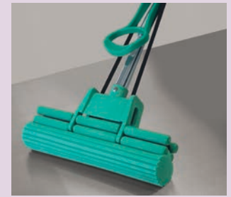
Ribbed Block Mop with integral wringer handle extends up to 4.5 feet