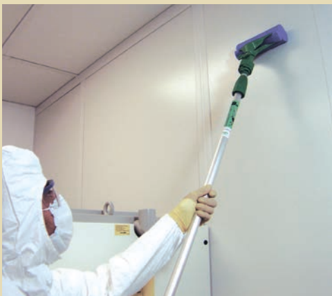
PVA Ribbed Mop with 8 foot extension handle . . . never scratches or drips